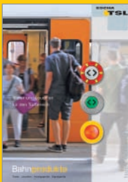
Train products for the door area

ESCHA TSL GmbH Elberfelder Str. 1 . 58553 Halver . Germany Sales: Phone: +49 2353 66796-0 . Fax: +49 2353 66796-99 info@escha-tsl.de . www.escha-tsl.com