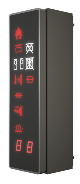
24, 72 or 100 VDC+25%/-30% -25°C to +70°C depending on the configuration