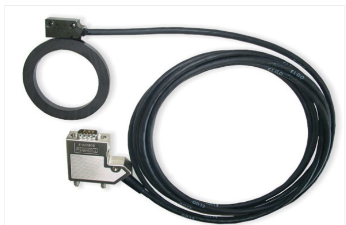
Magnetic ring with EMIX1 measuring system